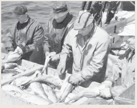
Flounder's Crew fillets their catch for tonight's Sashimi.